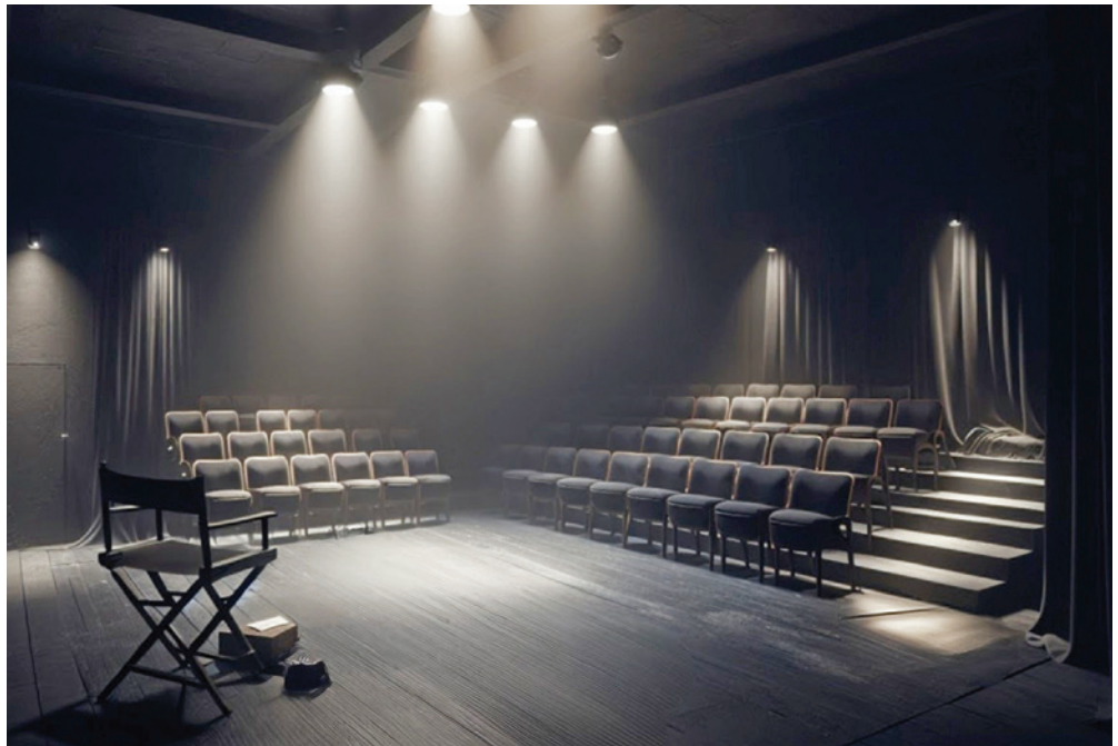
Example of a Black Box Theater. Note: Not final design, for reference only.

The Black Box Theaters at the Huntridge will have the creative and economic flexibility key to fostering powerful artistic voices when they are most needed. Your support will enable artists and arts organizations to grow new followers, fans and benefactors by showcasing their talent and vision within these first-in-class performance spaces. Your support will make the Huntridge Theater the place where careers are launched and lives are changed, for both artists and audience.