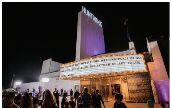
Marquee Re-Lighting Event, April 2023

By providing innovative spaces for artists and culture creators to explore, collaborate and create, the Huntridge Theater will lead the way in educating and inspiring the people of Las Vegas, young and old, to gather within this historic building to experience and celebrate the distinctive arts culture of Las Vegas in all its forms.