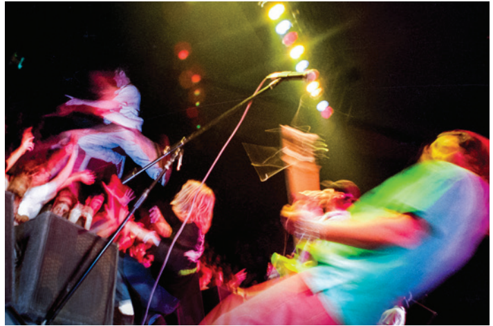
Concert

After decades of sharing the magic of movies with Las Vegas of all ages, the Huntridge Theater was converted to a live events venue in 1992. The historic building would now use its next chapter to bring the electrifying energy of world class rock-n-roll, punk, pop and alternative performers to the stage. Iconic artists and bands such as Green Day, No Doubt, The Killers, Foo Fighters, Beck, Red Hot Chili Peppers, Sarah McLachlan, The Cranberries, Sublime, Beastie Boys, Violent Femmes and Suzanne Vega, among many others, created indelible memories for thousands of concert goers. In an era when attending live concerts was the epicenter of American shared cultural experiences and the foundational coming-of-age building blocks for an entire generation of Las Vegas, the Huntridge Theater was the place to be.