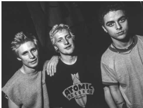
Green Day backstage at the Huntridge, 1993.

In 2004, a two-decade intermission would begin for the Huntridge Theater. The historic icon sat idle through several well intended but inevitably unsuccessful attempts to renovate and restore the legendary venue.