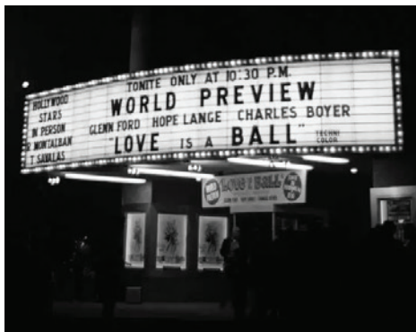
Love is a Ball World Premiere, 1963